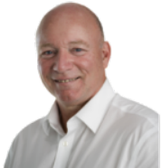
Frank Haselbach, Airbus - SVP Propulsion “The Airbus runway to sustainable aviation”