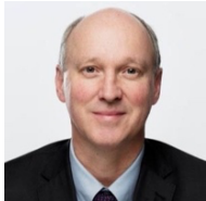
Olle Norberg, Director-General, IRF - Swedish Institute of Space Physics “Exploring the Solar System, a Swedish perspective on Space Science”