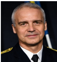
Jonas Wikman, Commander Swedish Air Force "Swedish Air Force in the future"